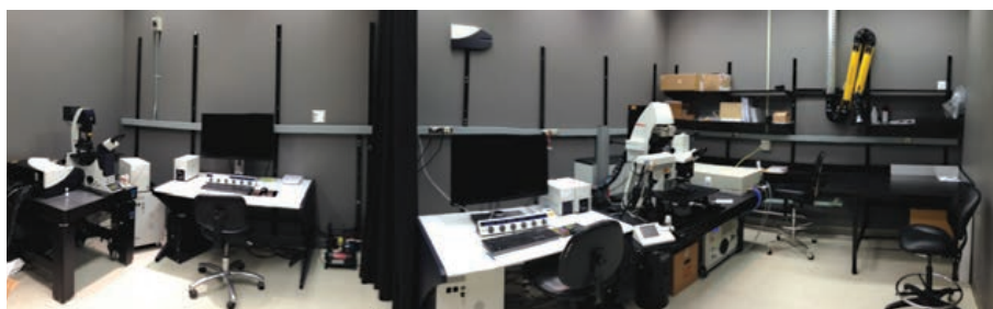
Dianne and Irving Kipnes Lymphedema Imaging Suite.

A comprehensive set of references can be found at www.lymphedemapathways.ca .