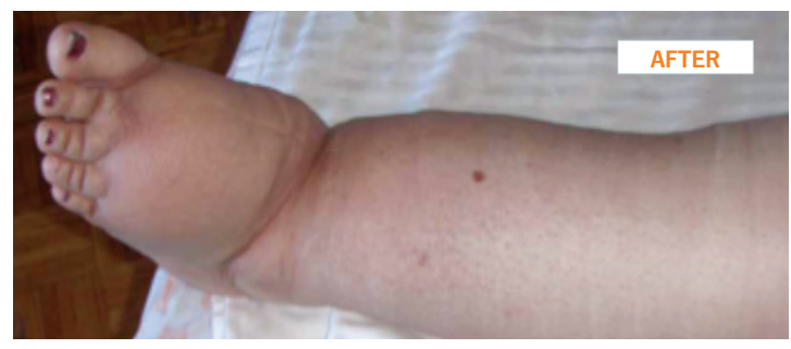
After fourth treatment

She was diagnosed with lymphedema due to filariasis (LF), which is not uncommon in India. In Canada, a vascular specialist put her in contact with her local Community Care Access Centre (CCAC) in 2011. The CCAC bandaged her