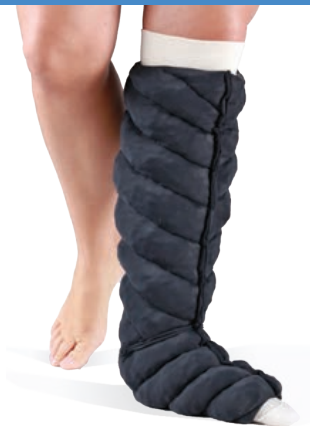
LYMPHEDEMA COMPRESSION WEAR