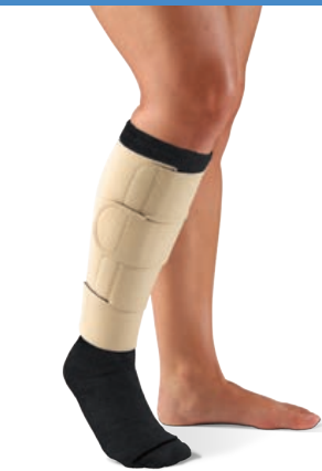
WOUND CARE COMPRESSION WEAR