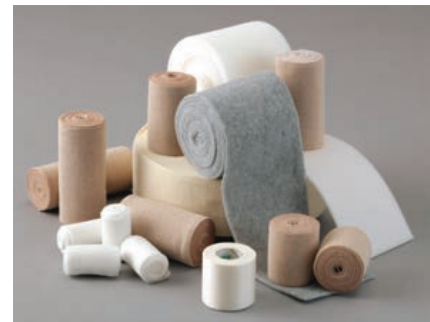
BANDAGES & THERAPY SUPPLIES