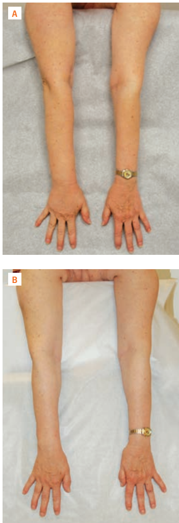
Patient with compressible, fluid-predominant right arm lymphedema following treatment for breast cancer with bilateral mastectomy, right lymph node dissection and radiation therapy. A) Arms prior to surgery B) 4½ -year stable result following VLNT performed together with a DIEP flap for breast reconstruction. She requires no daily compression garment or therapy.

Safety and surgical expertise are critical to minimize the rare risk of lymphedema occurring at the donor site. Reverse lymphatic mapping can minimize this risk by mapping the lymph nodes draining the arm or leg closest to the lymph node flap donor site using a radioactive tracer similar to the technique used in lymphoscintigraphy, or specialized blue dye taken up by the peripheral lymphatics. During the dissection of the lymph node-containing flap in reverse mapping, the lymph nodes draining the arm or leg are thus identified and preserved and only a small number of peripheral lymph nodes are harvested.